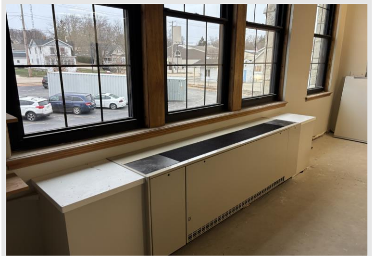
A look at one of the new unit ventilators installed with countertops on either side for a sleek finish!