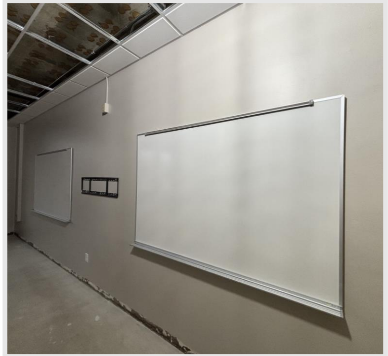
Installation of new visual displays has been completed in the Phase 4 Classrooms!